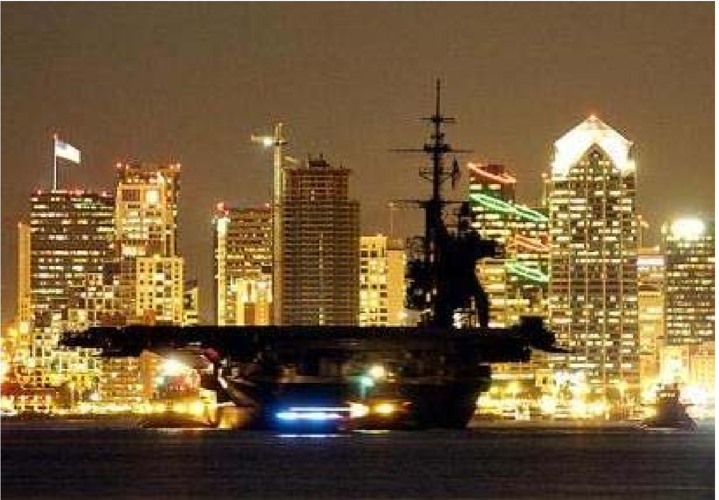
[capt.gox1010106230.midway_museum_gox101]